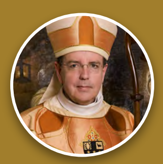
ARCHBISHOP ALLEN VIGNERON